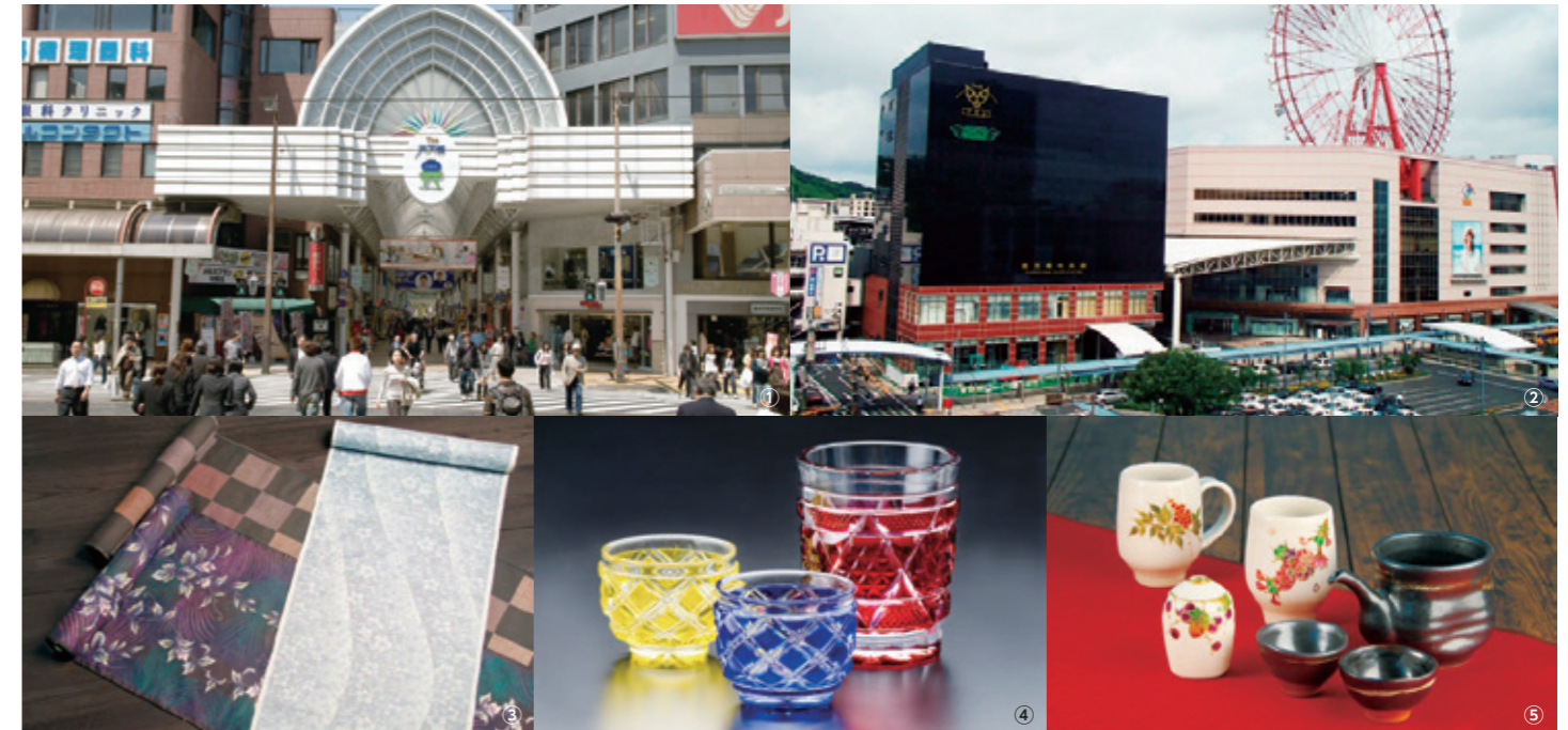
① Tenmonkan District ②Kagoshima-Chuo Station ③Authentic Oshima Tsumugi fabric ④Satsuma Kiriko cut glass ⑤Satsuma ware

Tenmonkan, Kagoshima's main street, and the area around Kagoshima-Chuo Station, Japan's southernmost Shinkansen station and where transport and commercial facilities are concentrated, are always bustling with residents and tourists. Kagoshima City is a lively town, thanks to the concentration of its tourism industry that includes the city's restaurant and hotel industries, its wholesale, retail, and manufacturing industries that handle the prefecture's bountiful food, and other industries such as health care and welfare service. Many traditional handicrafts are still made by craftsmen in the old way; these include authentic Oshima Tsumugi fabric, Satsuma Kiriko cut glass, Satsuma ware, Satsuma tin vessels, bamboo crafts, and Yakusugi cedar products.