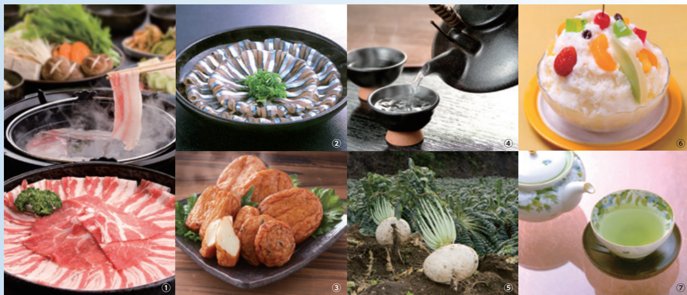
①Dishes with black pork and black beef ② Kibinago herring sashimi ③Satsuma-age fried fishcake ④ Shochu liquor ⑤Sakurajima daikon radish ⑥ Shirokuma shaved ice ⑦Tea

Blessed with a warm climate and a rich natural environment, Kagoshima is a treasure trove of food. It has developed its own food culture with influence from the Chinese mainland and the Ryukyu Islands. Many authentic culinary delights await visitors: Kagoshima Black Beef, one of the country's finest wagyu-style beefs; Kagoshima-brand Black Pork; seafood like the Kibinago herring and greater amberjack; Japan's greatest production of sweet potatoes and second-greatest production of tea; the Sakurajima daikon radish, which is grown on the active volcano of Sakurajima and recognized by the Guinness Book of Records as the world's heaviest radish.