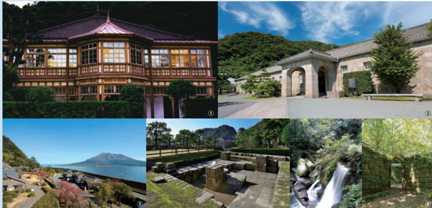
①Former Kagoshima Spinning Engineer's Residence (Westerner's House) ②Former Shuseikan Machinery Factory ③Sengan-en Garden ④Reverberatory furnace ⑤Sekiyoshi Sluice Gate of Yoshino Leat ⑥Terayama Charcoal Kiln

At the end of Japan's Edo period (1603-1867), the wise Shimazu Nariakira of the Satsuma clan that ruled Kagoshima at the time was aware of the dangers posed by the encroachment of the Western powers on Asia. To modernize his domain's industry and military, he carried out a wide range of research and manufacturing of iron and glass, ships, cannons and other weapons, steam locomotives, telegraphs, photographs, and other technological developments. The Shuseikan Project was the major project that started Japan's industrial revolution. The sites that remain tell of those days; these include the former Shuseikan, the Terayama Charcoal Kiln, and the Sekiyoshi Sluice Gate of Yoshino Leat, which are inscribed on the World Heritage list as part of the "Sites of Japan's Meiji Industrial Revolution: Iron and Steel, Shipbuilding and Coal Mining."